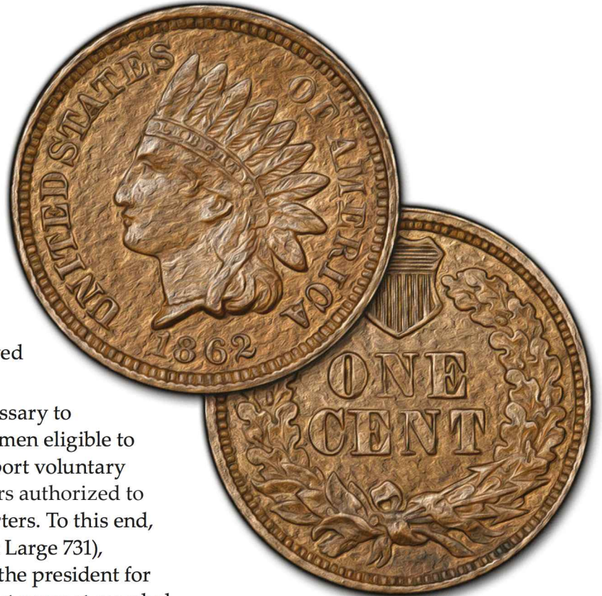
The Indian Head cent, also known as an Indian Head penny, was a one-cent coin ($0.01) produced by the United States Bureau of the Mint from 1859 to 1909. It was designed by James Barton Longacre, the Chief Engraver at the Philadelphia Mint.

This Register of Accounts from the Fifth District of Maine usually has at least eight column headings on each two-page spread: (1) Date of Account; (2) Number; (3) Name; (4) On What Account [product or service]; (5) Amount; (6) To Whom Sent; (7) When Sent; and (8) Remarks. Some pages also have a "Date [of] check" column and an "Entered" column indicating that similar information was entered into a second volume. Accounts were sent to the Provost Marshal General (Washington, DC), the Acting Assistant Provost Marshal General for Maine (Augusta, Maine), and occasionally various officers of the Office of the Quartermaster General.